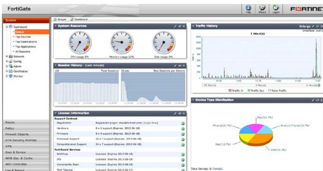
FortiOS Dashboard — Single Pane of Glass Management

Fortinet's FortiCare support offerings provide comprehensive global support for all of your Fortinet products and services. If the need arises, our teams of support staff are available to assist you anytime day or night to give you the assurance that your Fortinet products are performing optimally and providing the protection your infrastructure, users, applications and data demand.